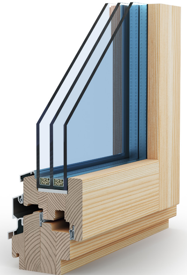
VIEW OF WINDOW FROM INSIDE