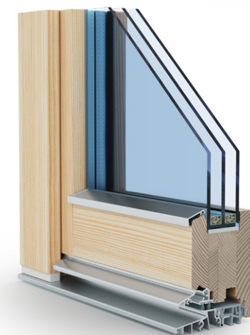
20 mm aluminium threshold