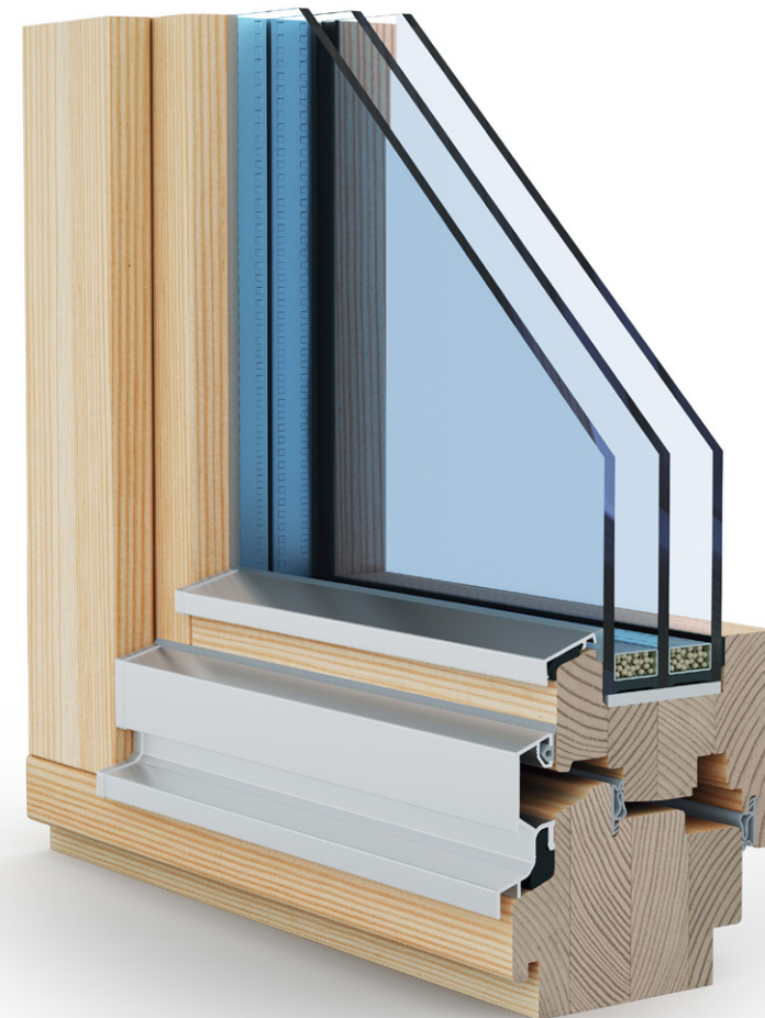
VIEW OF WINDOW FROM OUTSIDE