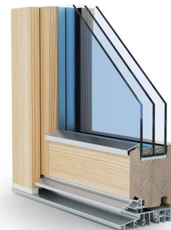
20 mm aluminium threshold