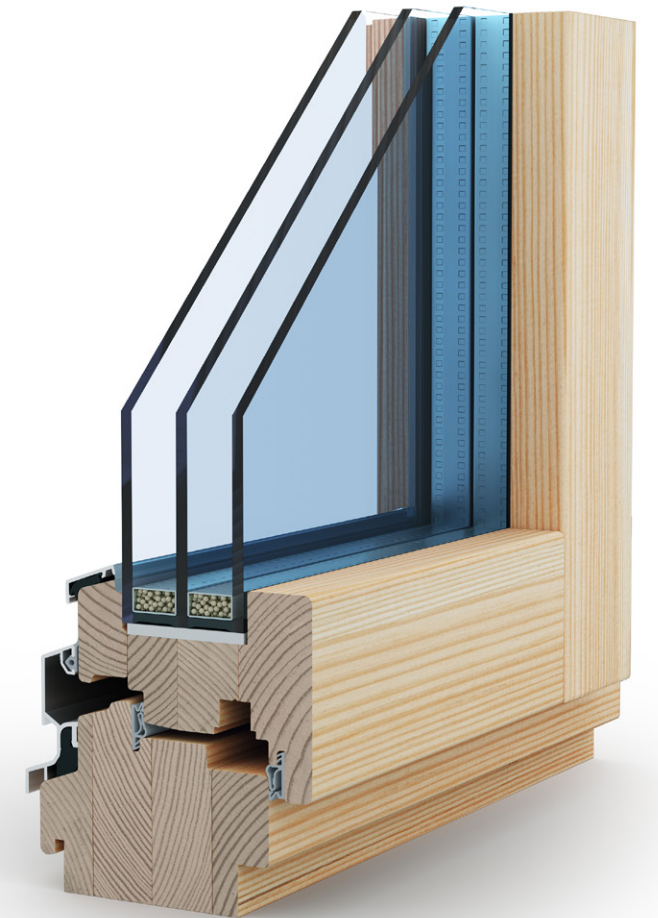
VIEW OF WINDOW FROM INSIDE